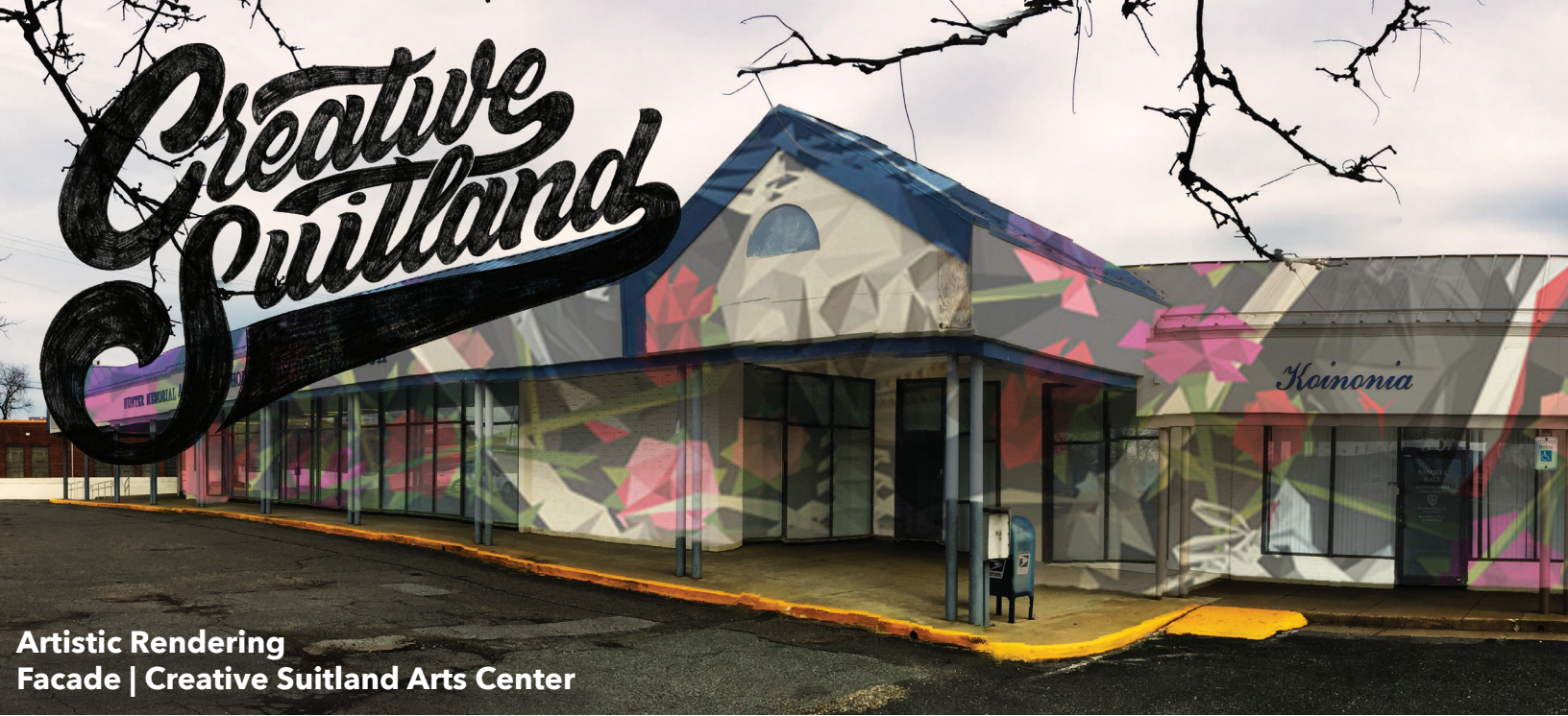
Artistic Rendering Facade | Creative Suitland Arts Center