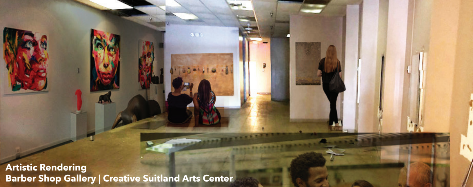
Artistic Rendering Barber Shop Gallery | Creative Suitland Arts Center