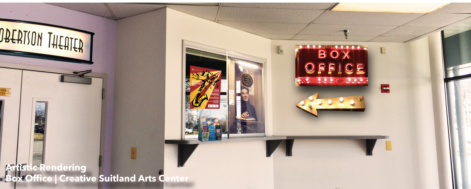
Artistic Rendering Box Office | Creative Suitland Arts Center

The county has a need for new teaching artists to meet the demands for quality arts education programs for youth and adults. A professional development institute could be created within CreativeWorks for arts educators and working with Suitland CVPA students. Exposure to the field would enhance young artists ability to stay within arts related work, sustain their craft, network, and support their vision as a working artist.