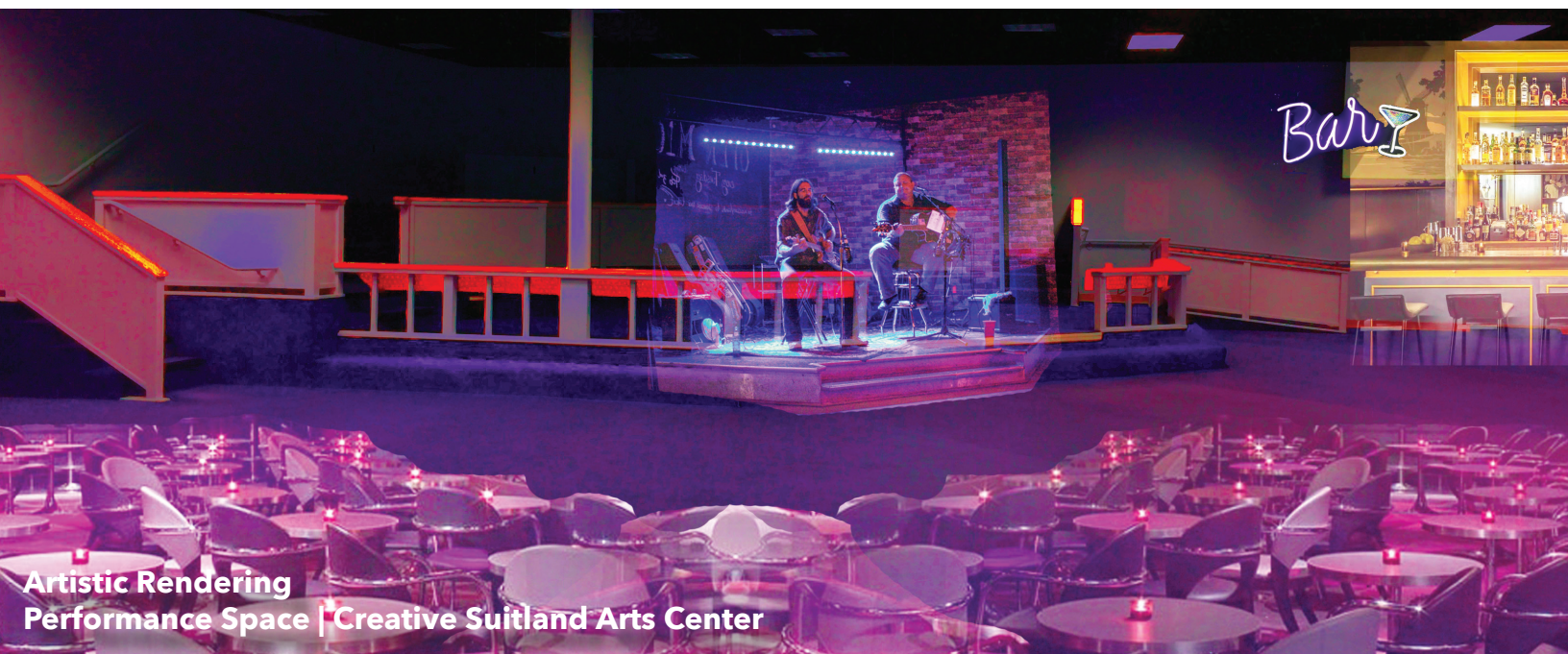
Artistic Rendering Performance Space | Creative Suitland Arts Center